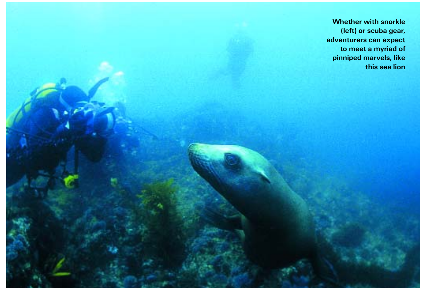
Whether with snorkle (left) or scuba gear, adventurers can expect to meet a myriad of pinniped marvels, like this sea lion