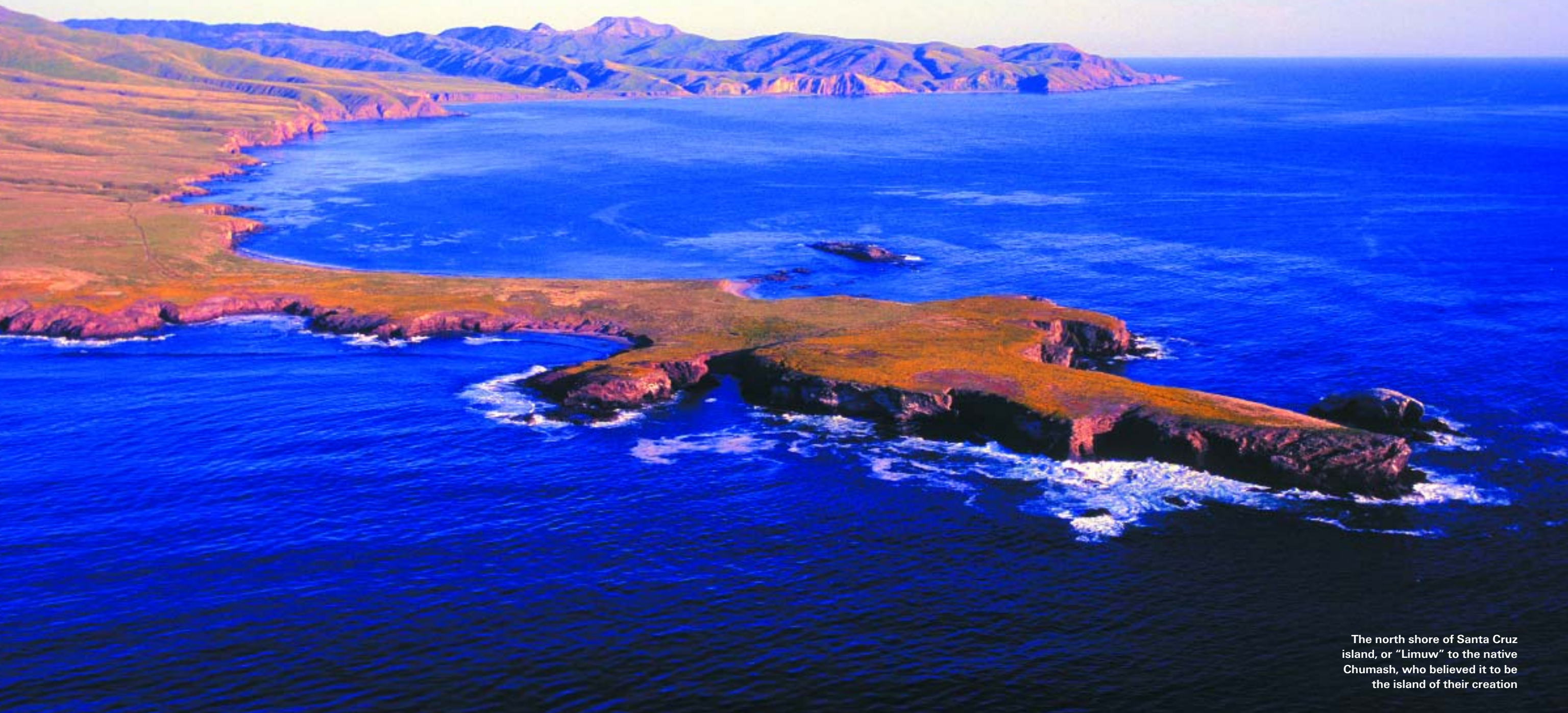
The north shore of Santa Cruz island, or "Limuw" to the native Chumash, who believed it to be the island of their creation

cans and peregrine falcons nesting at Prince Island. And when it comes to exploring the islands' staggering array of archeological and historic sites – from the fossil remains of 13,000-year-old Arlington Woman to the 1923 wreck of the luxury liner Cuba ...well, nothing says fun so much as lots of time and space and