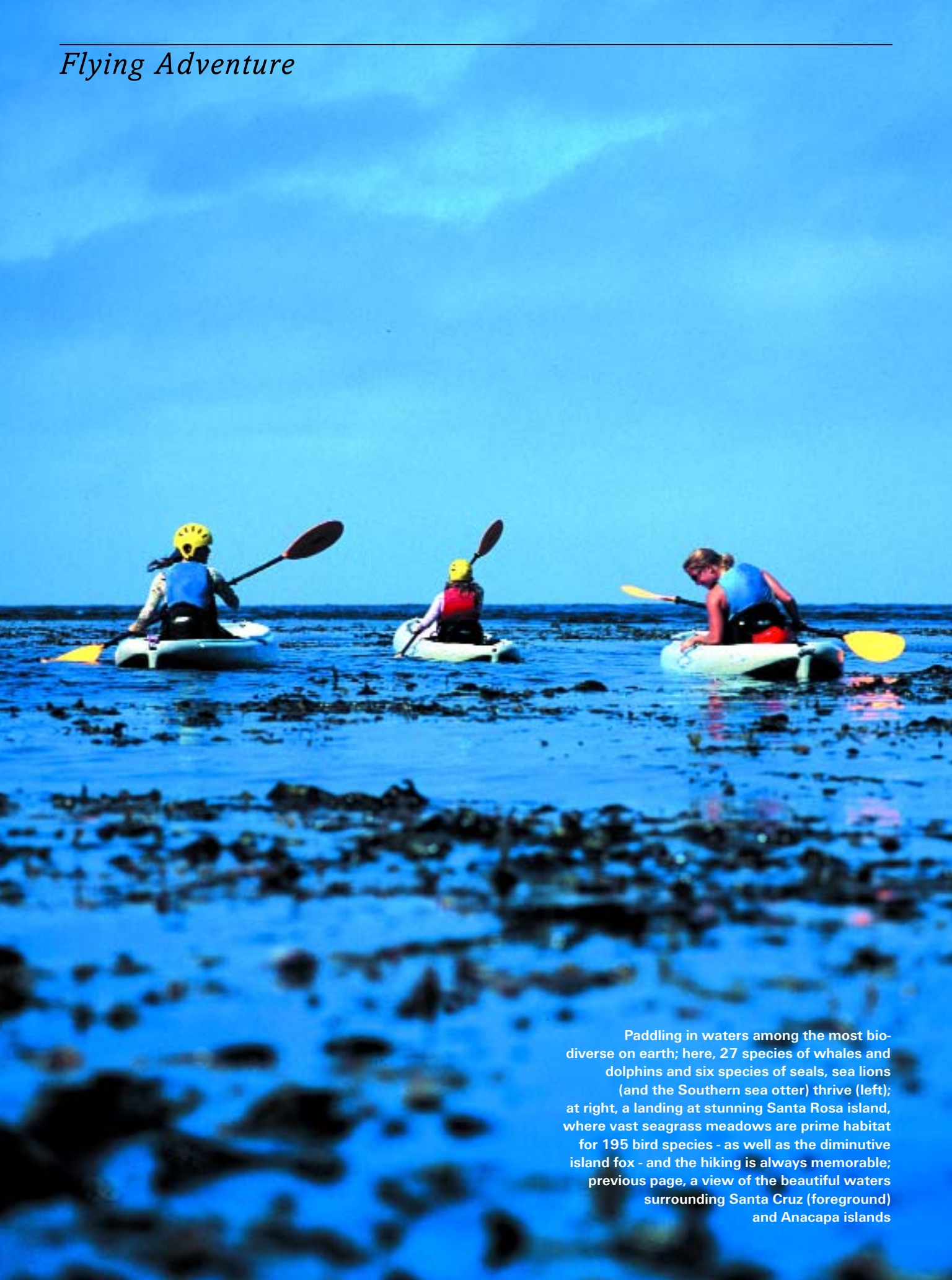
Paddling in waters among the most bio-diverse on earth; here, 27 species of whales and dolphins and six species of seals, sea lions (and the Southern sea otter) thrive (left); at right, a landing at stunning Santa Rosa island, where vast seagrass meadows are prime habitat for 195 bird species - as well as the diminutive island fox - and the hiking is always memorable; previous page, a view of the beautiful waters surrounding Santa Cruz (foreground) and Anacapa islands